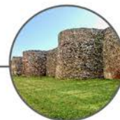
Roman wall of Lugo