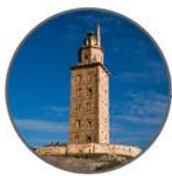
Tower of Hércules