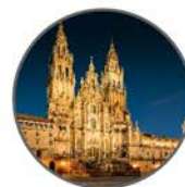
Cathedral of Santiago de Compostela