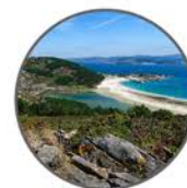
Atlantic Islands National Park